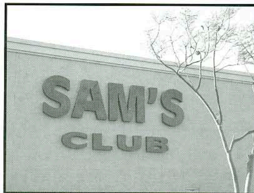
They've Got America Hooked: Analysts say sales grew 11% in 2004 and the company estimates 90% of us (or 270 million people) shopped at one of their entities last year.