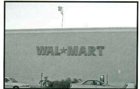
The American flag perched proudly above this Southern California store seems almost ironic: 80% of the 6,000 factories worldwide that supply Wal-Mart's stores are located in China.

But it's just not discrimination sparking the ire of America. This company faces a plethora of infractions and charges ranging from breaking child labor laws to hiring illegal immigrants, operating an illegal anti-union slush fund, undercutting suppliers and destroying smaller, less competitive retailers. Critics have also repeatedly attacked Wal-Mart's history of paying below-poverty wages and not providing affordable, quality healthcare for