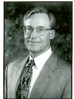
S. Robson Walton

Forbes reports that the five family members of the late Wal-Mart founder are together worth over $90 billion.