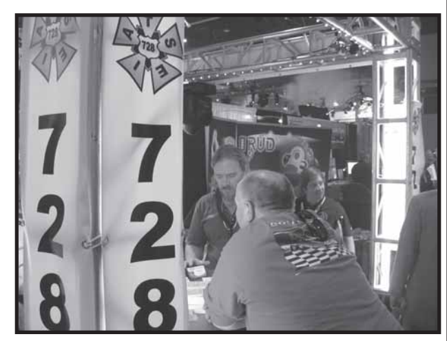
Despite a less-than-ideal booth location, over 1,000 LDI participants visited the Local 728 booth at the Las Vegas Convention Center.

Perhaps the biggest thrill was to hear the comments of the members of the various Studio Mechanics locals